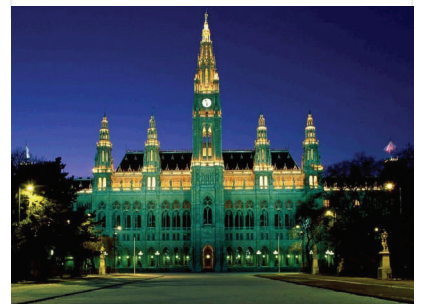
The conference took place in the rooms of Vienna's City Hall

Through this event, the CTCC has once again collaborated with IFEA Europe, the leading European network connecting festivals & public event professionals around the world. Our mission is to bring together all those that are active in the cultural festival and event sector. We share ideas and best practice to facilitate continued development and promote networking and international exchange. IFEA Europe acts in the interest of all cultural festivals and events in Europe, offers relevant products and services and offers valuable benefits to its members. For further information go to www.ifeaeurope.com .