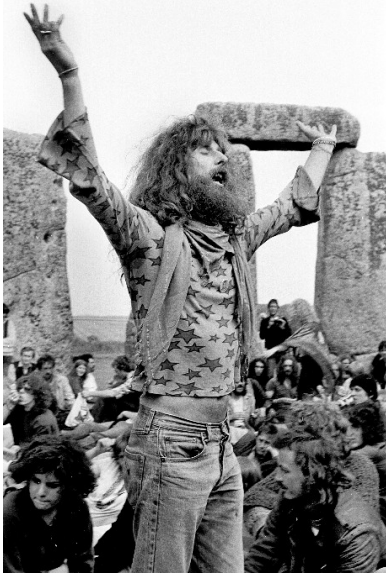
Stonehenge free festival, Wiltshire, Summer Solstice, June 1982.