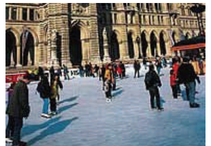
Delegates enjoyed ice skating in front of Vienna's City Hall